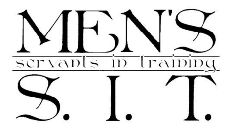
Friday & Saturday